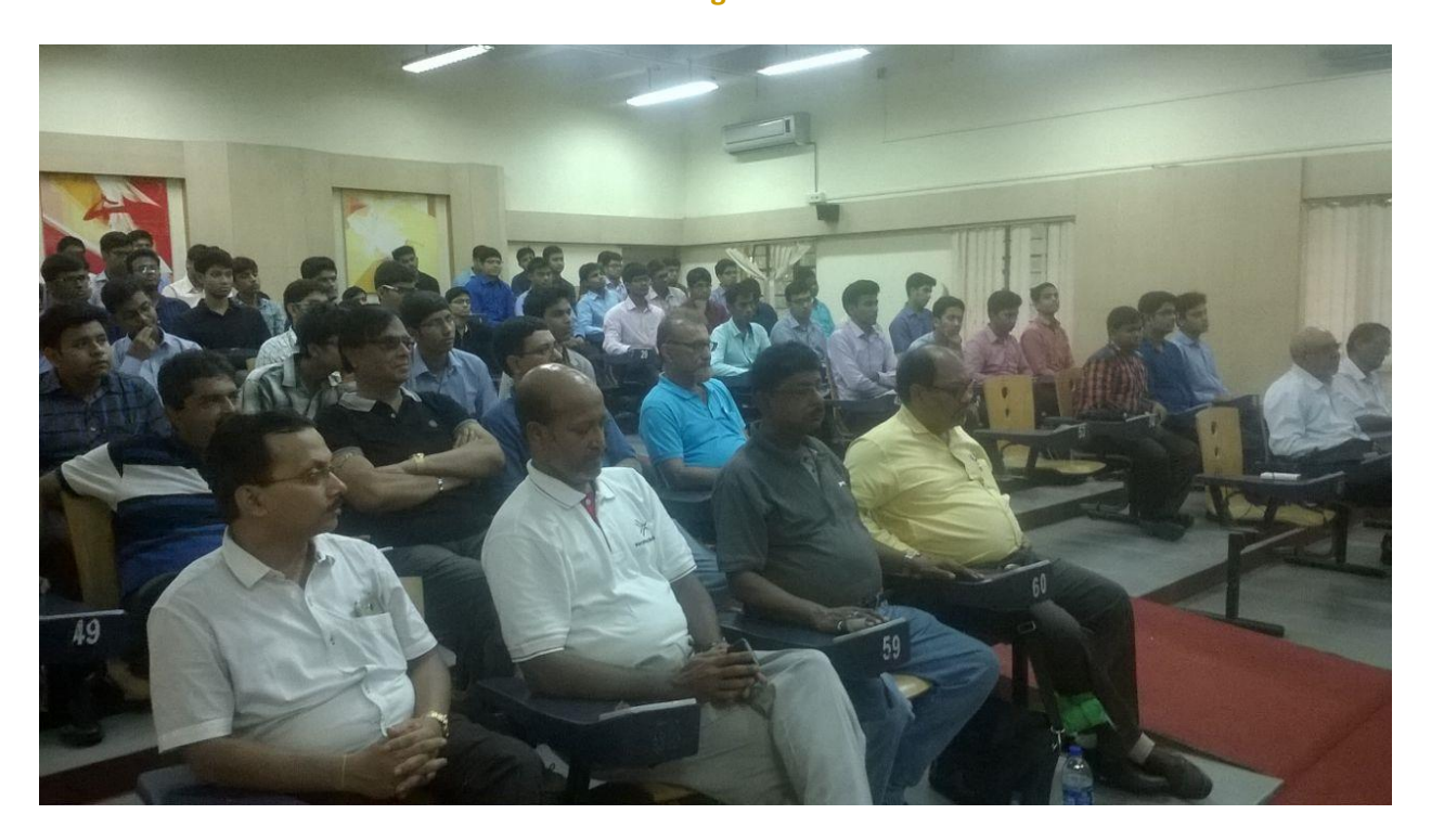
Preface & Feedback sessions of Innovation Challenge: